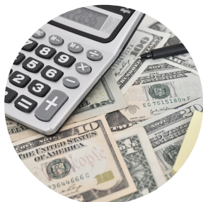
Finance & Accounting