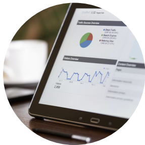
Marketing & Creative